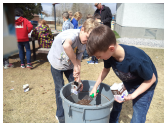
Grade 4 and 5 Planting seeds