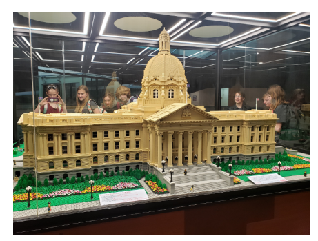
These models are made of Lego