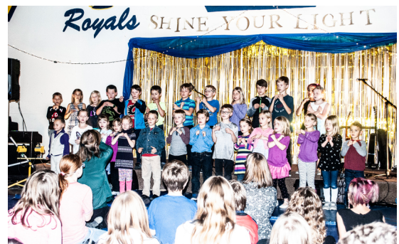
Kindergarten - Grade 3 Choir