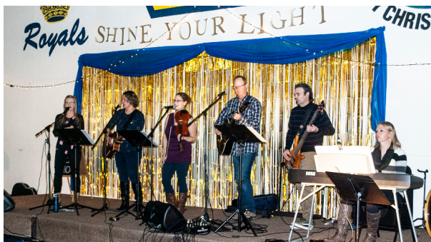
Live entertainment by Six Track