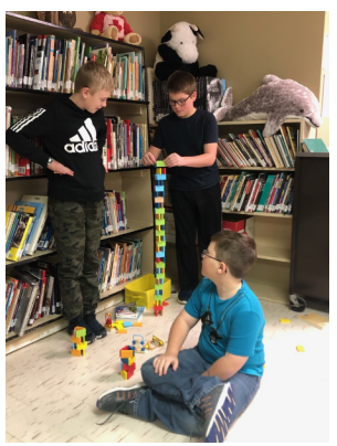
Having some fun building towers in the library.