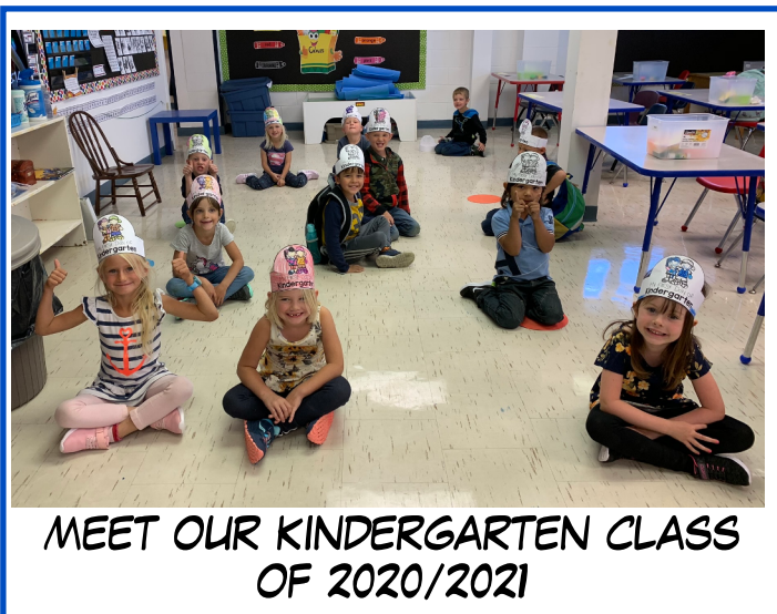
MEET OUR KINDERGARTEN CLASS OF 2020/2021