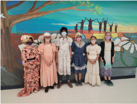
Grade 5 girls ready to go to school at the museum