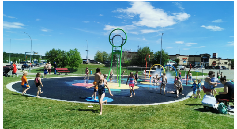
Grade 2 and 3 enjoying the beautiful weather at the spray park