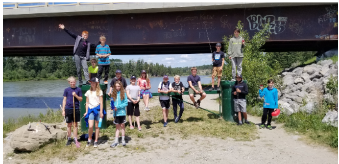
Grade 6 and 7 enjoying a trip to the river

This is a great way to build up some volunteer hours and to get to know other members of our school community.