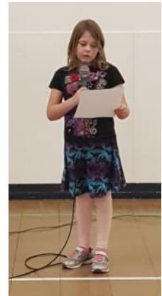
In Flanders Field