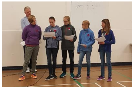
CTF Actions Class A brief history of Canada and it's role in the war.