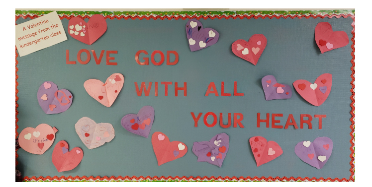
A Valentine message from the kindergarten class...

Brushing your teeth is a very important life skill and helps to promote overall health. Our grade three class has become a shining example by brushing their teeth every day after lunch.