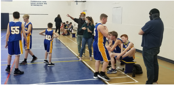
RCS BOYS VS. PIONEER