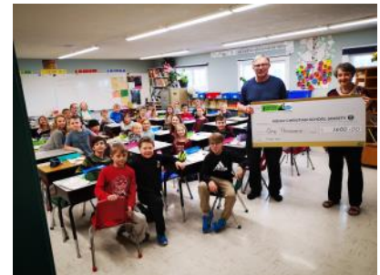
Lone Pine Forest Products