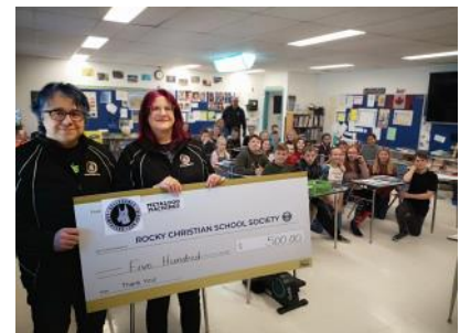
Metal Dog Machines