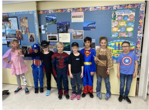
GRADE 2/3 SUPER HERO DAY