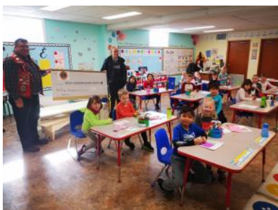
The Lion's Club