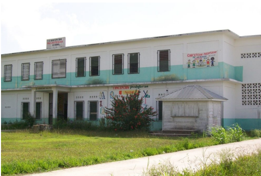
Concepcion Presbyterian School

➤ If you would like to give an online donation to a member of the team, or the team as a whole, you can do so on the EduDeo Ministries website under "Get Involved" -> Co-Impact Teams -> See Teams -> Rocky Christian School 2023. Online donations will receive charitable donation receipts.