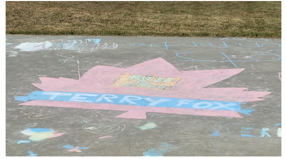
Some creative artwork from the Terry Fox run on October 6.

Show your support for your favourite team and wear a jersey on Tuesday, November 22.