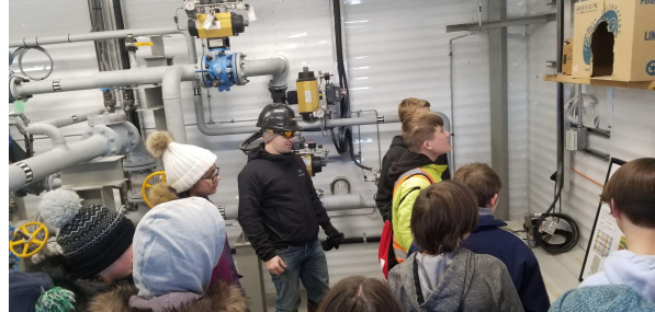
Geothermal Energy Shack