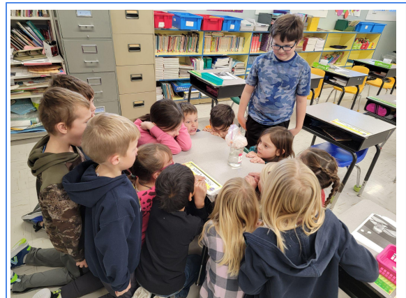
Grade 3 students watching a water cycle experiment in a jar.