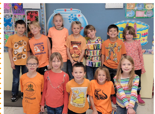
Grade 2 & 3 Orange Shirt Day