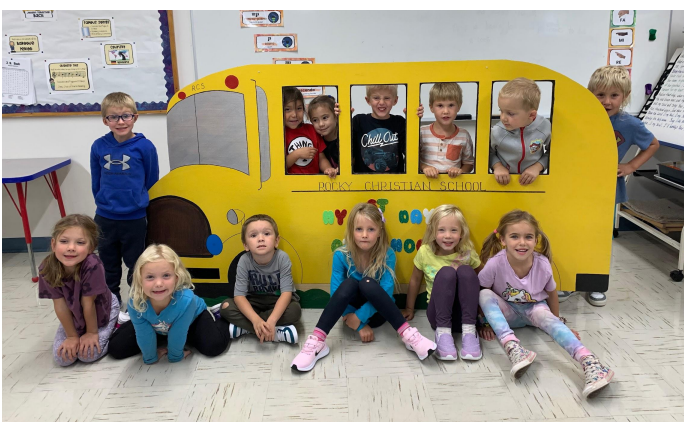
All aboard and ready for kindergarten!