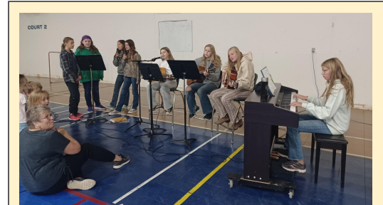
Student Worship Team leading Chapel praise & worship

The Lord's Food Bank Neighbours Helping Neighbours appreciative of our thoughtfulness.