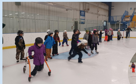
Grade 2 & 3 Fun On Ice