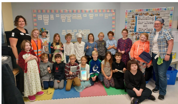
Grade two and three

We had Servant Workers, Creation Enjoyers, Beauty Creators and many other Throughlines represented at our Throughline Dress Up Day.